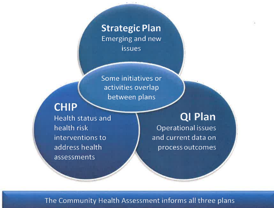
Figure 1. Plan Association

In collaboration with the community and stakeholders, the CHIP was developed with, and as, a community plan. The CHIP was developed based on the CHA to address priorities in the community that impact the overall health of the community. The health district is deeply involved in the community health improvement process and is a leading organization throughout the process. The CHIP results in a shared community plan where multiple stakeholders have a role in implementing and monitoring its benchmarks and outcomes.